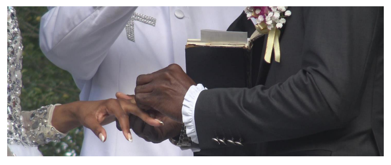
Page 5 of 9