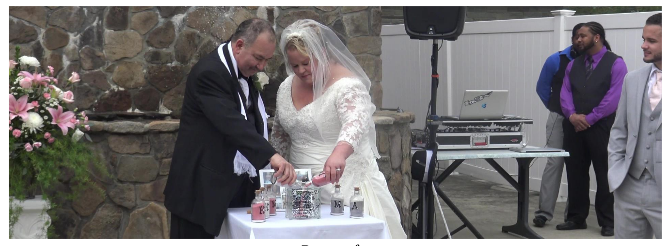
Page 7 of 9